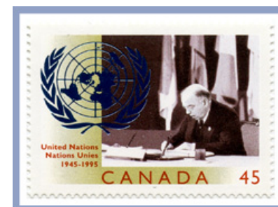
Prime Minister Mackenzie King, signing the Charter

After the victory of the 'United Nations' forces over the Axis, the plan to replace the League of Nations with the new world peace organization came to realization. The United Nations was founded during the April through June 1945 United Nations Conference on International Organization held in the San Francisco Opera House and Veteran's Center. The League of Nations was formally dissolved during its last Assembly in April 1946 and the United Nations was designated as the League of Nations' official successor.