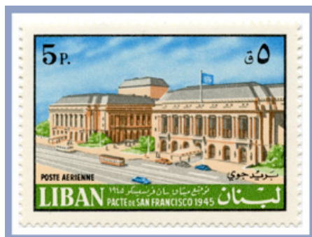
Opera House and Veteran's Center

After the victory of the 'United Nations' forces over the Axis, the plan to replace the League of Nations with the new world peace organization came to realization. The United Nations was founded during the April through June 1945 United Nations Conference on International Organization held in the San Francisco Opera House and Veteran's Center. The League of Nations was formally dissolved during its last Assembly in April 1946 and the United Nations was designated as the League of Nations' official successor.