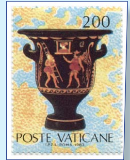
Zeus with ladder climbing to Alceme's window

Acting on impulse, Zeus changed his physical shape to resemble her husband returning from battle. That evening time slowed to the length of three and Hercules was thus conceived.