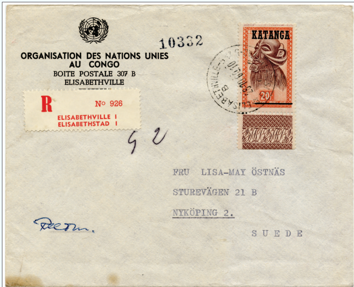
Elisabethville, Congo to Nyköping, Sweden, 29 October 1960, registration and postage paid with overprint 'Katanga'