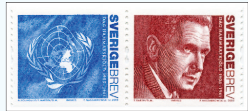
Dag Hammarskjöld and U.N. flag Secretary-General of the United Nations

Swedish economist and diplomat Dag Hammarskjöld (1905-1961) served as second Secretary-General of the United Nations from April 1953 until his death in 1961. He was en-route to a cease-fire negotiation when his plane mysteriously crashed during the Congo Crisis.