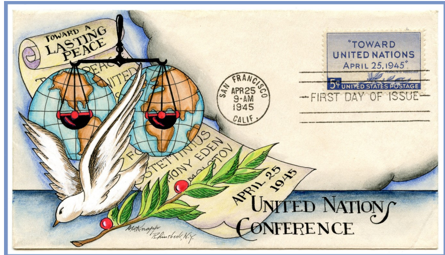
Figure 1: First day cover with cachet by artist Dorothy W. Knapp

The first day of issue of modern postage stamps is normally accompanied by a cacheted first day cover. The cachet (illustration) is clearly relative to the stamp's subject and usually added on the left side of the envelope; 928 being no exception. 928 has its share of cachets both privately and commercially produced. Some designs utilize more than only the left side and turn the cover into a canvas whereon the artist produces a colorful work of art. Some may even be hand tinted such as this design by Dorothy W. Knapp (Figure 1). Collectors