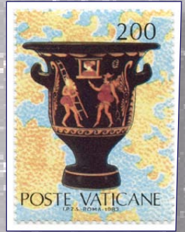
Zeus with ladder climbing to Alceme's window

Acting on impulse, Zeus changed his physical shape to resemble her husband returning from battle. That evening time slowed to the length of three and Hercules was thus conceived.