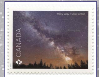
Milkyway with millions of stars

Hermes, messenger of the gods, was instructed by Zeus to put Hercules on sleeping Hera's breast to suckle, thus making him a demigod and later immortal. Hera awoke and pushed Hercules away allowing milk to spill into the heavens and the droplets formed the stars of the Milkyway.