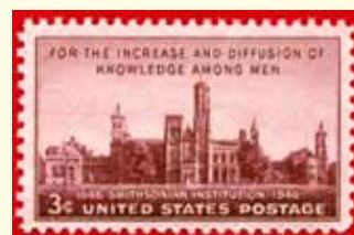
The Castle Three cent Commemorative Issue

The first issue of August 10, 1946 (domestic first class letter rate of 3 cents) commemorated the 100th anniversary of the museum and the stamp design is from an official photograph taken by F.B. Kestner, Smithsonian photographer.