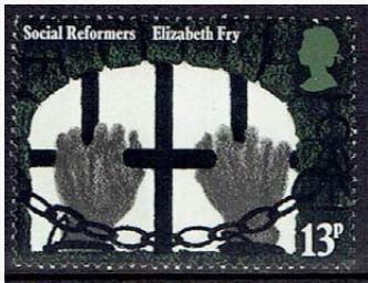
Elizabeth Fry (1780-1845) Social activist

History offers many examples of 'Peace' being shepherded along a path to better peoples' lives. Such efforts invariably result in the formation of organizations. The London Peace Society was formed in 1816 as England's premier pacifist organization and remained active until the mid-1930s. It was mainly concerned with disarmament and composed of many prominent English pacifists. It maintained several auxiliary arms in various English cities. Due to varying political and social views of the day, it split into several societies, each with an agenda based on the respective leaders. It was an early leader of many national efforts in the ' world peace movement '.