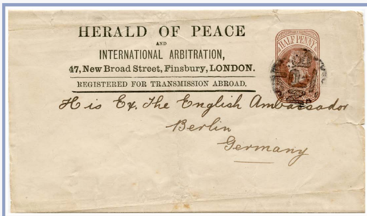
London, England to the English Ambassador in Berlin, Germany, circa 1870s Newspaper wrapper for London Peace Society newsletter