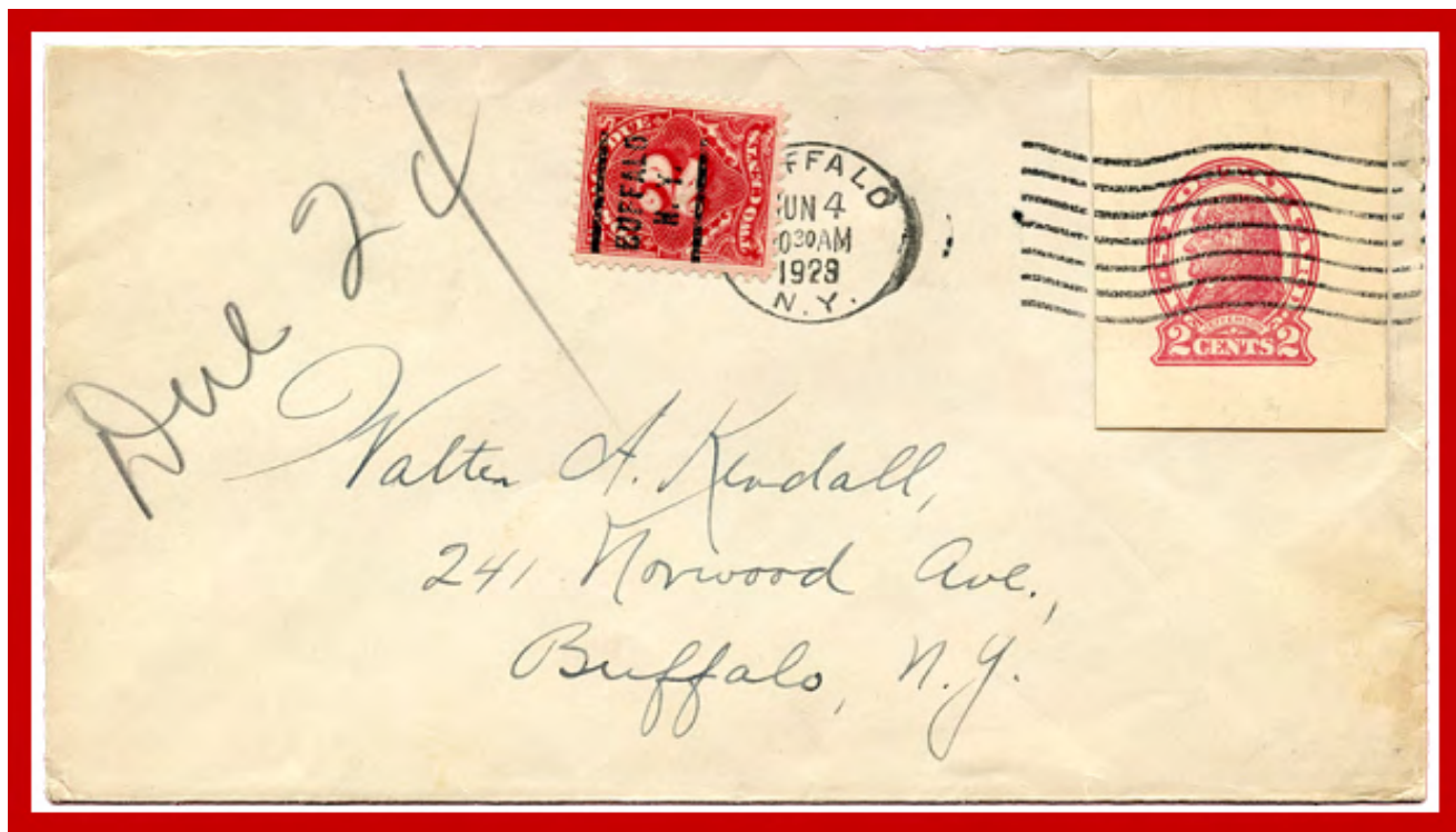
Jefferson card cut-out used on first class letter

Postal card indicia are valid for postal cards they are printed on. When indicia on a card is mistakenly not canceled, it could be cut out and pasted onto a mailable item. This un-sanctioned practice is found as frugal mailers used the postage they had to mail letters.